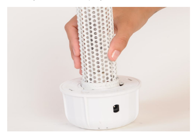
QR+ Cell Replacement The Guardian Air QR+<sup>™</sup> also features a quick-release design for easy removal of the PHI Cell® as well.